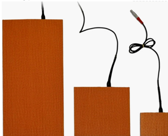
Cage Heating Pad 16x38cm

Heating pads are available in three different sizes: