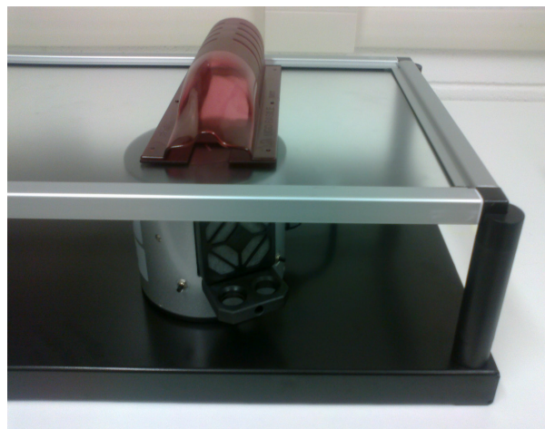
The picture above shows a Durham Holder positioned on a classic Ugo Basile Plantar Test (Hargreaves) device.

The holder allows the animal to be positioned in such a way to use the classic Plantar Test instruments for stimulating the hindpaw, as well as the areas innervated by the trigeminal nerve.