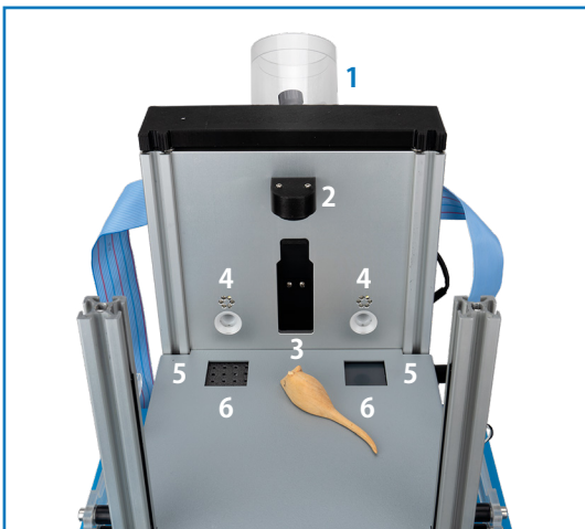
Hundreds of combinations of stimuli across three dimensions (olfactory, visual, tactile)