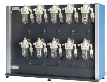
10-channel odour delivery with air delivery/suction system