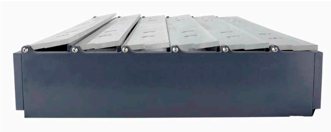
Before (Original mice lane assembly)