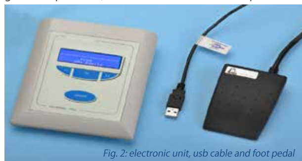
Fig. 2: electronic unit, usb cable and foot pedal

The e-VF comes as a complete package including touch stimulator transducer with prism , electronic unit with power supply, foot pedal, software & USB cable . The mesh grid with platform, and animal enclosure are optional.