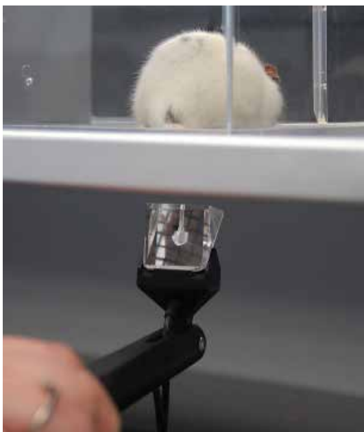
Fig. 1: "touch stimulator" with prism. Optional grid mesh not included

The metal tip used in the e-VF is the same as the one used in the classic Ugo Basile Dynamic Plantar Aesthesiometer 37450 , allowing consistent comparison of results among the two instruments.