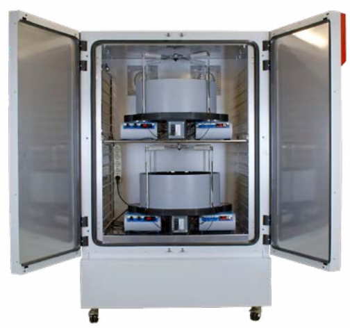
Temperature controlled cabinet (-10/+100 °C range temperature) to hold up to two Thermal Gradient Rings under constant temperature and sound isolation, to be not depending on of the lab room temperature (optional item)