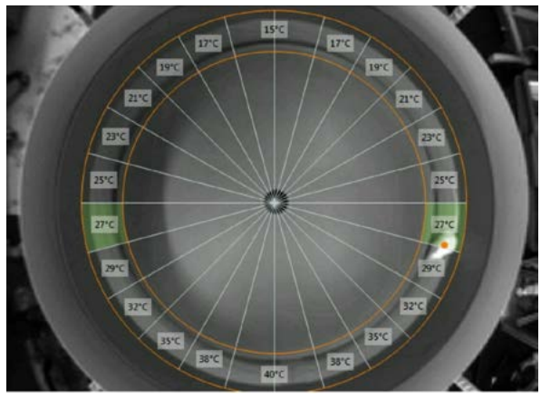
ANY-Maze Video-tracking software automatically analyses thermal preference and avoidance parameters.

A dedicated (TGR limited) ANY-Maze software version is available at a lower price than the ANY-Maze full version and also includes TGR protocol ready to use