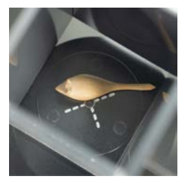
Plantar Test for Thermal Stimulation SKU 35750